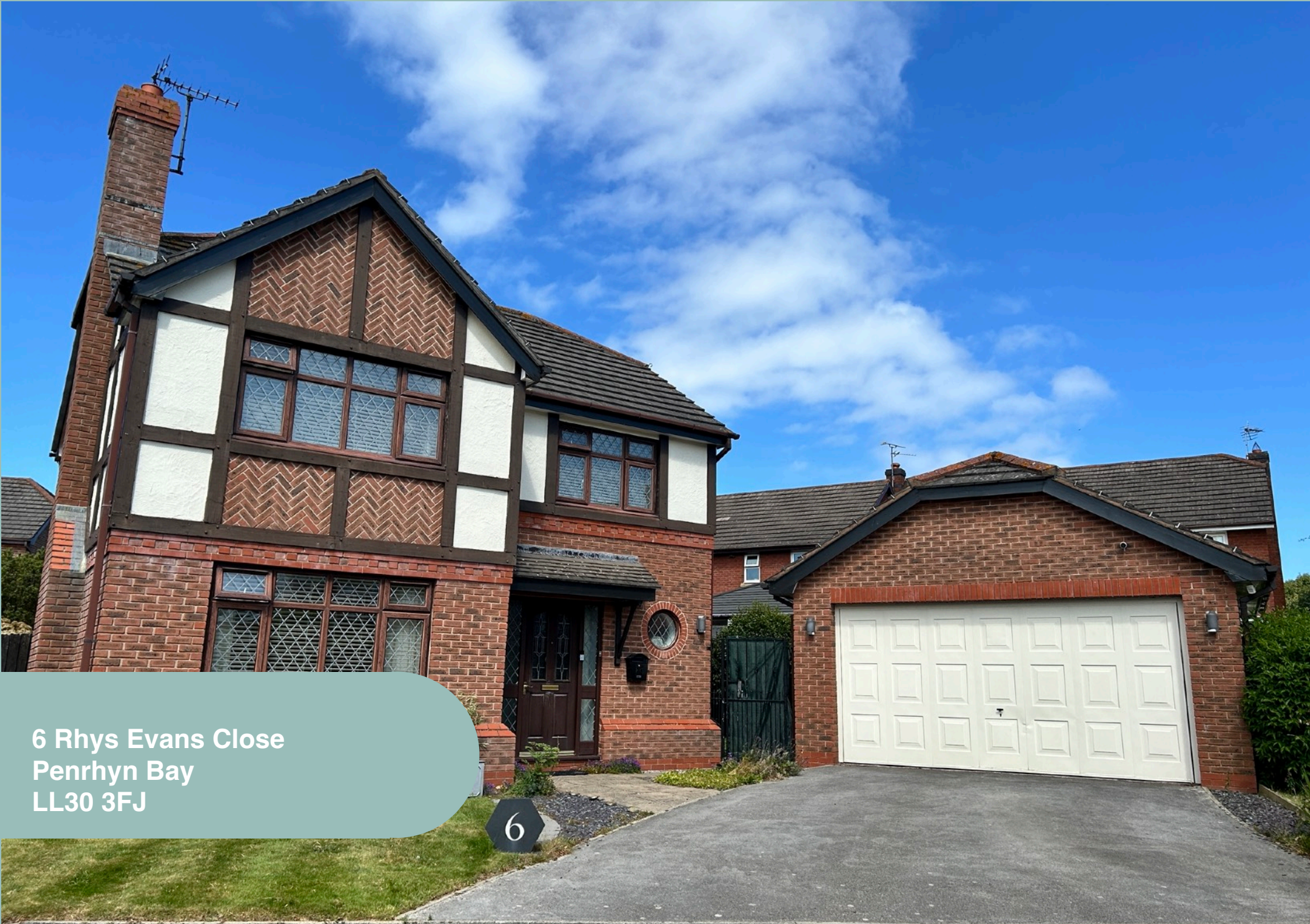
6 Rhys Evans Close Penrhyn Bay LL30 3FJ